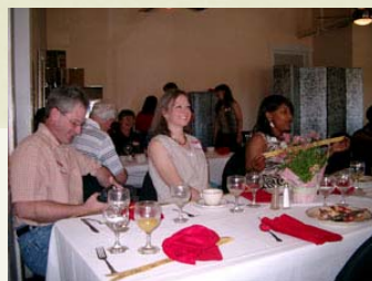
Enjoying the brunch