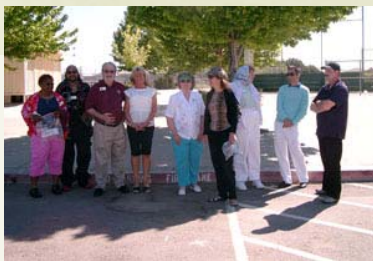
Gathering for the caravan

After stuffing ourselves with scrumptious food, several of us drove to the Old Sugar Mill for wine tasting and more fun. Finally tearing ourselves away, each departed for home, thinking about what a grand time we all had and looking forward to next year's Ride to Ryde.