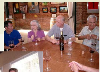
Wine and friends at the Old Sugar Mill