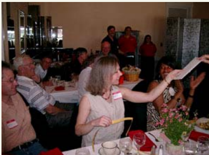
Grand prize winner