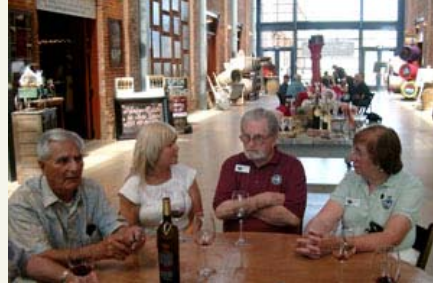
Good fun at the Old Sugar Mill