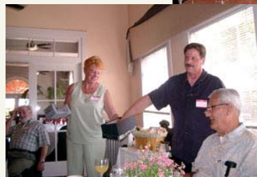
Great raffle prizes

More pictures from the Ride to Ryde on page 5