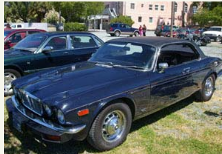
Jaguar XJ6C, a real beauty