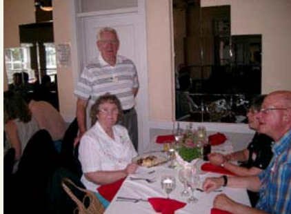
As usual, the brunch was excellent

The next meeting will be at 6:30 PM on May 15th at the Paradise Grill, 1410 East Roseville Parkway ( North Sunrise Avenue and East Roseville Parkway) Roseville.