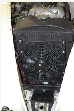
Left— Fan Installation in front of the radiator