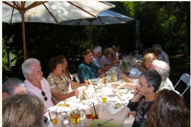
A fine lunch at the St. George's Hotel in Volcano