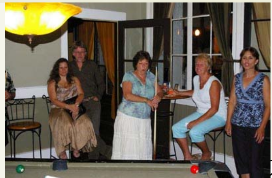
Right— A bit of pocket billiards to finish off the evening