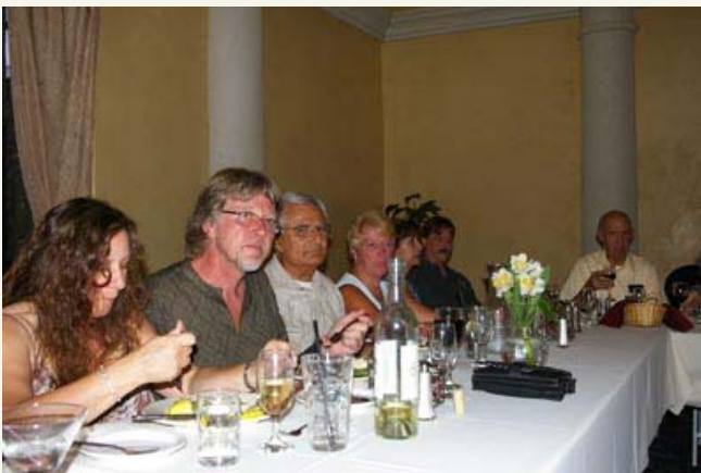
The Leger Hotel served a fine dinner enjoyed by all