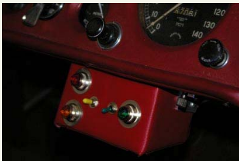
Left — Under dash control panel turns fan on and off

*The only bulbs available are 6 volt. The control panel includes 2 dropping resistors from Radio Shack.