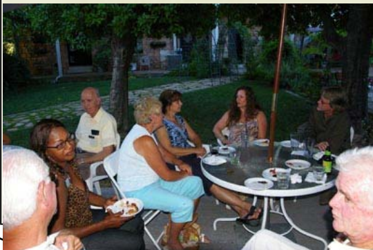
Left — Hors d'oeuvres and conversation on the patio