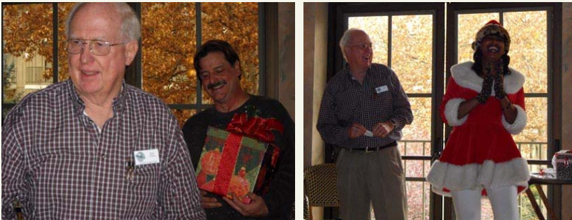
The new President takes charge