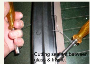
Cutting sealant between glass & frame.