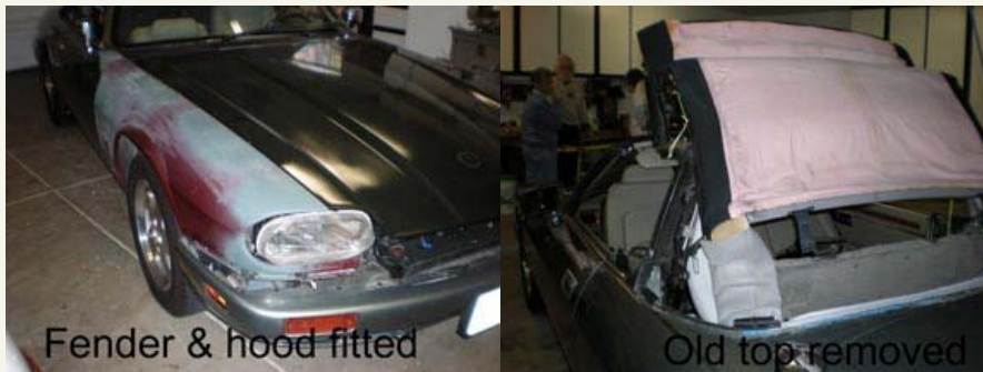
Fender & hood fitted