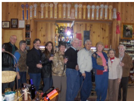
Far right: Members and friends further from home at the Denver AGM