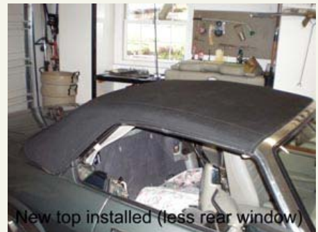
New top installed (less rear window)