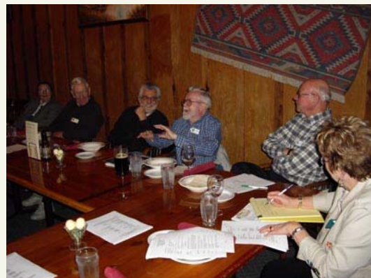
February meeting at Cattleman's in Ranch Cordova