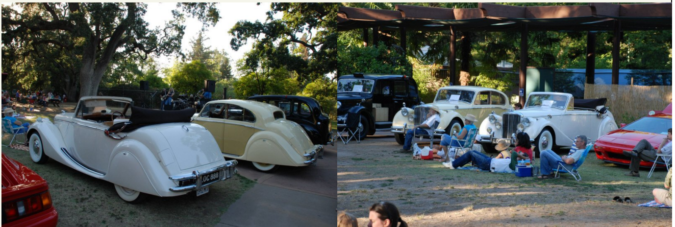
Relaxing with British cars at the zoo