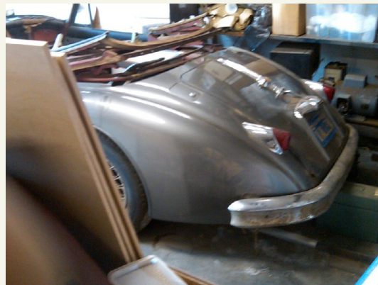
Project III XK150 DHC in the Giglio garage in Long Beach.