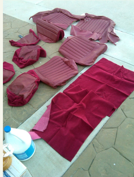
Part of new interior.