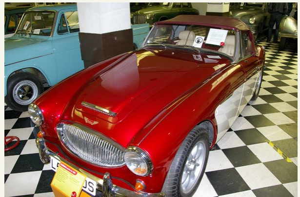
Haldane 1994 replica of an Austin Healy