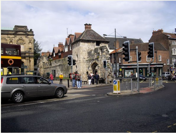
Street scene in York England