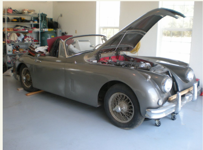
At its new temporary home in Loomis.