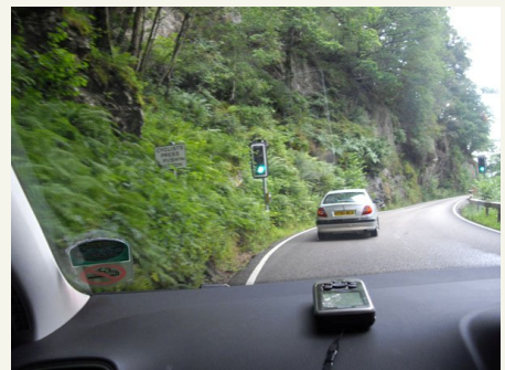
A narrow Scottish road with traffic control; the sign on the hill tells cyclists to push the button