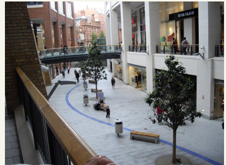
A new Belfast shopping center