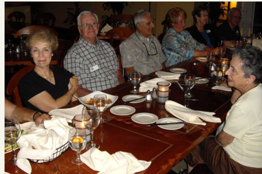
Dinner at the Embassy Suites Hotel in Old Sacramento