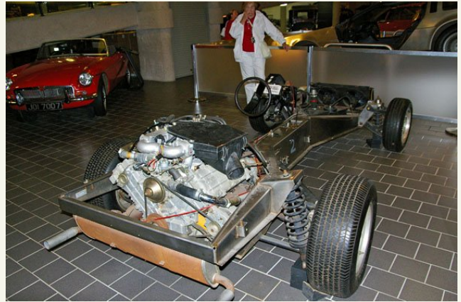
A De Lorean sans stainless steel body