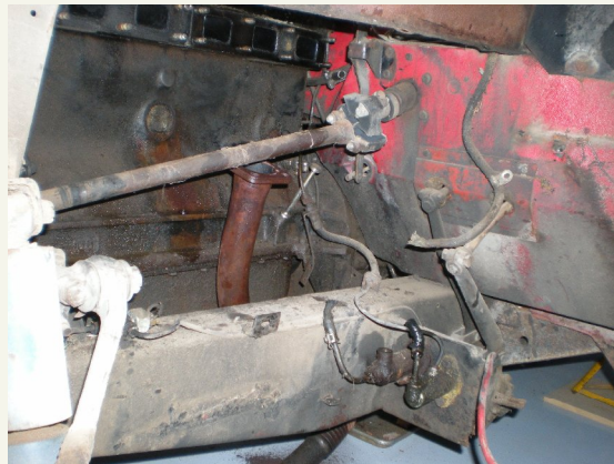
Same area after removal of battery box.