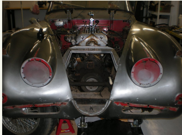
Front with radiator, chrome and lights stripped.