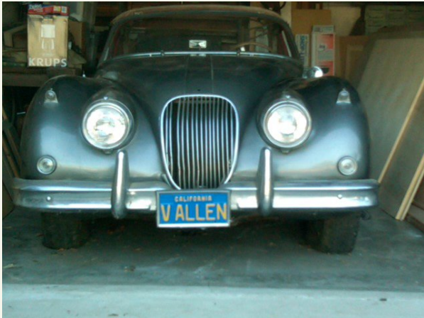
Front as started