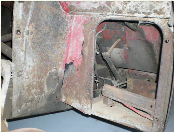
Front left hand fender well showing battery box.