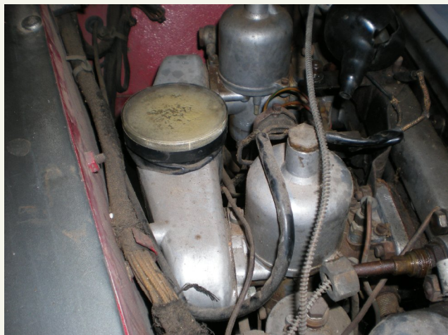
Right side of engine with dual carburetors