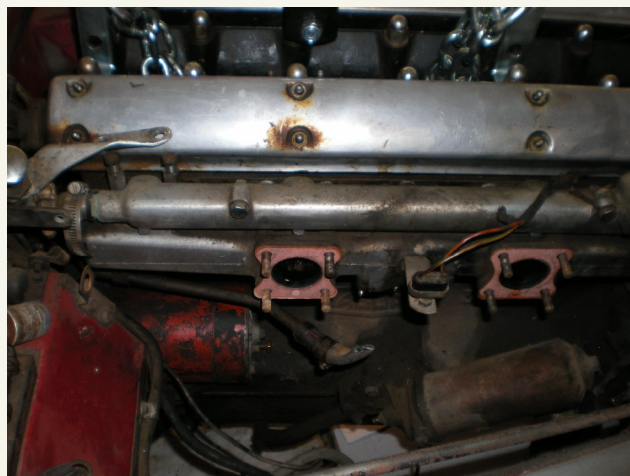
Right side after removal of carbs and ignition.