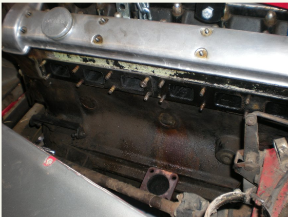
Left side of engine with exhaust and Dynamo removed.